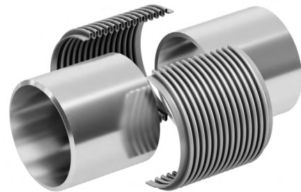
Same size clamshell

The pipe line must be shut down to install a same-size clamshell and the current bellows to be replaced is removed and discarded.